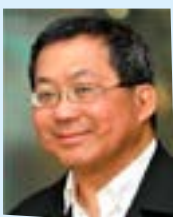
Dr. Ken Yeang Ecological Design