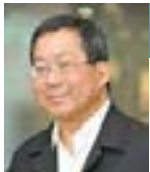
De Ken Yeang , Ph.D. Malaysia /UK

Medical Doctor, graduated in 2003 at University of Pisa, specialist in Public Health. Has prevalent experience in Hospital medical management in different Tuscan Hospitals. She deal mainly with Hospitals Organization and production (Diagnosis Related Groups sector) carried out the Agenas audits on the quality of the Italian Piano Nazionale Esiti data.