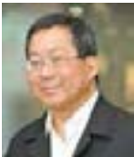
De Ken Yeang , Ph.D. Malaysia /UK

Medical Doctor, graduated in 2003 at University of Pisa, specialist in Public Health. Has prevalent experience in Hospital medical management in different Tuscan Hospitals. She deal mainly with Hospitals Organization and production (Diagnosis Related Groups sector) carried out the Agenas audits on the quality of the Italian Piano Nazionale Esiti data.