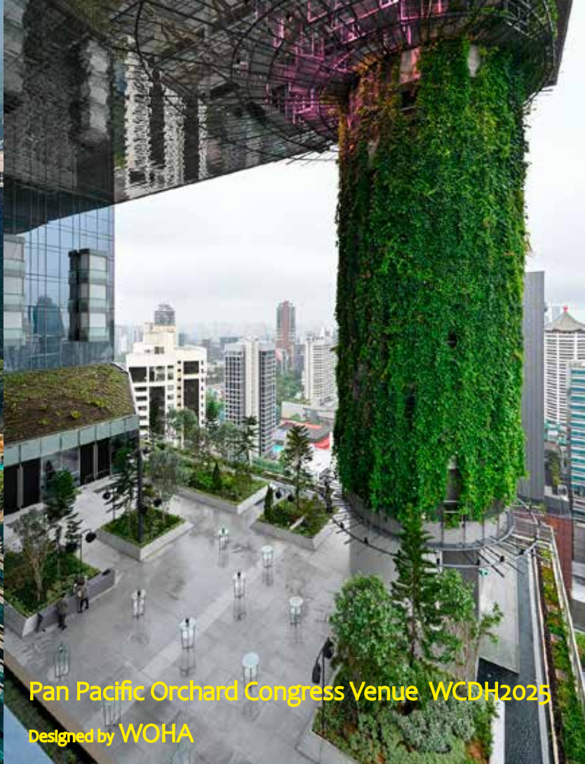
Pan Pacific Orchard Congress Venue WCDH2025 Designed by WOHA