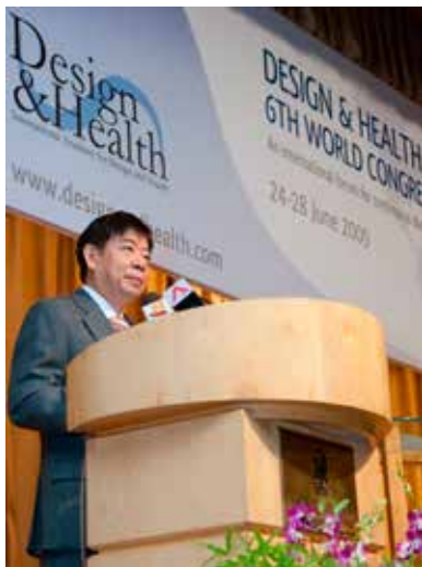
Singapore Minister of Health Mr Khaw Boon Wan speaking in 2009 Design and Health Congress

Singapore is a thriving metropolis offering a world-class infrastructure, a fully integrated island-wide transport network, dynamic business environment, vibrant living spaces and a rich culture largely influenced by the four major communities in Singapore with each offering different perspectives of life in Singapore in terms of culture, religion, food, language and history.