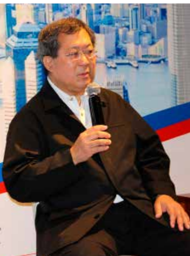
Dr. Ken Yeang speaking in Hong Kong 2015, Ecological Architecture